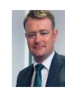
(ACTING) Designated Safeguarding Lead